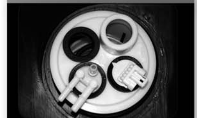
IMPROPERLY POSITIONED FUEL PUMP MODULE ASSEMBLY