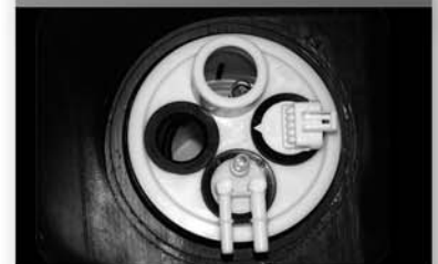
PROPERLY POSITIONED FUEL PUMP MODULE ASSEMBLY