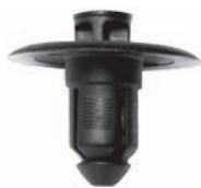
H011 push type cowl grille retainer