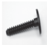
H007 cowl grille screw