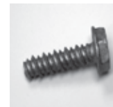
H009 filter splash guard screw