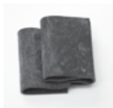
H006 cowl grille clip