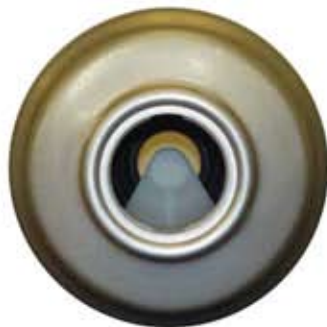
Bottom view of FF798A / LFF6012