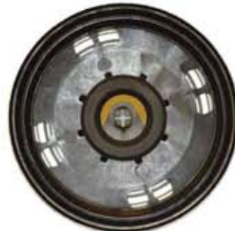
Top view of FF798A / LFF6012

Engine and equipment manufacturer's warranties remain in effect when Luber-finer filters are used.