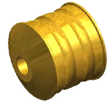
15.10.465.39 Sleeve x 2